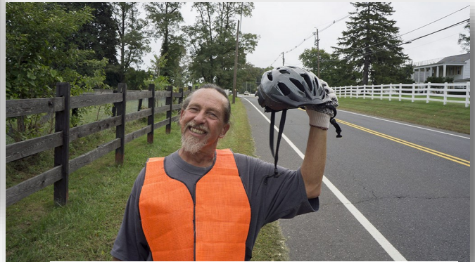
Thankfully it was empty.