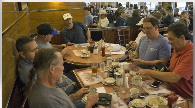
A well-deserved meal.