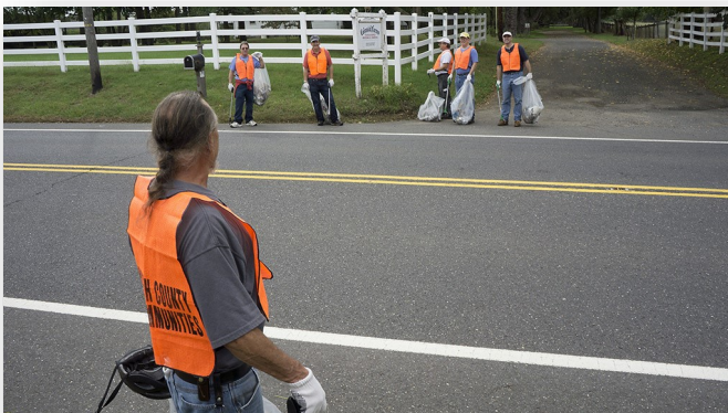
Key hand-off time!