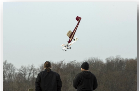
Fill in your own caption here.