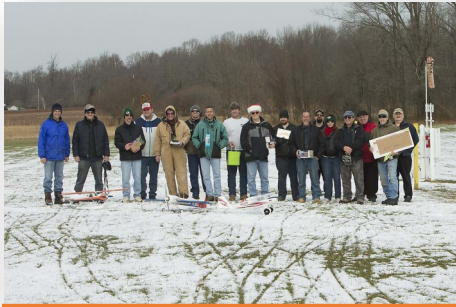
The festive crew!