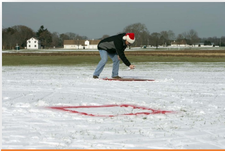
Marking the "houses"