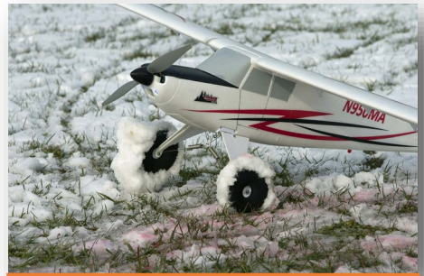
Snowy tundra tires!