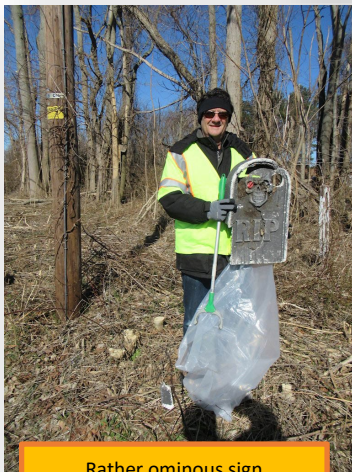
Rather ominous sign