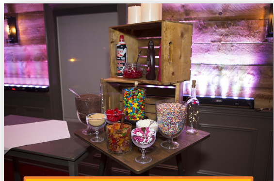
The ever-popular, oh-so-tasty ice cream bar! Thankfully everyone ate their meals so they could have dessert :)