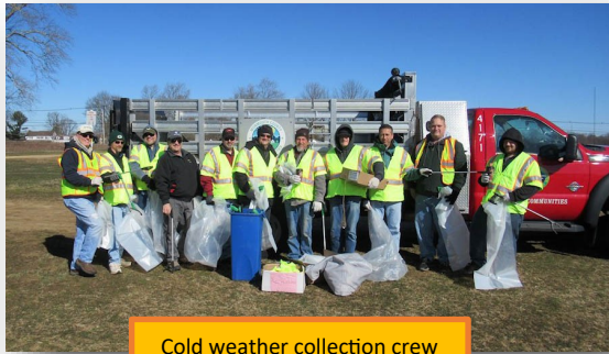
Cold weather collection crew