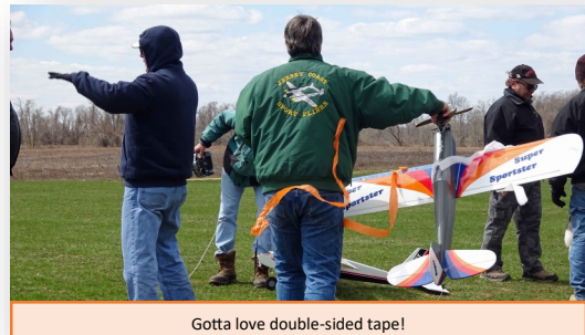
Gotta love double-sided tape!