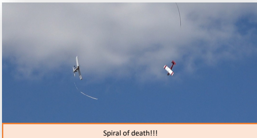
Spiral of death!!!