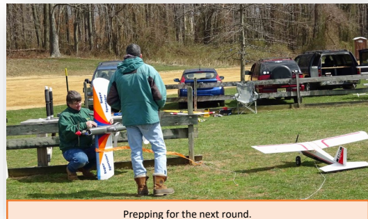
Prepping for the next round.