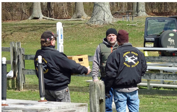
Getting ready for the fun!