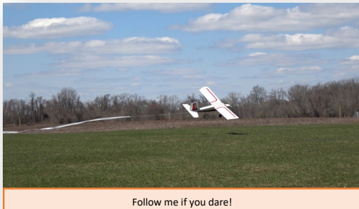
Follow me if you dare!