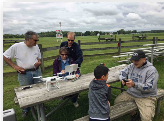
Working at the bench.