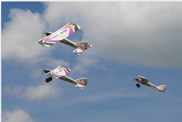
Master Stick formation flying.