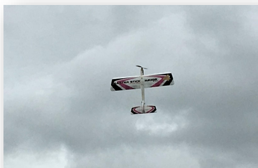
Hanging with the Hacker...