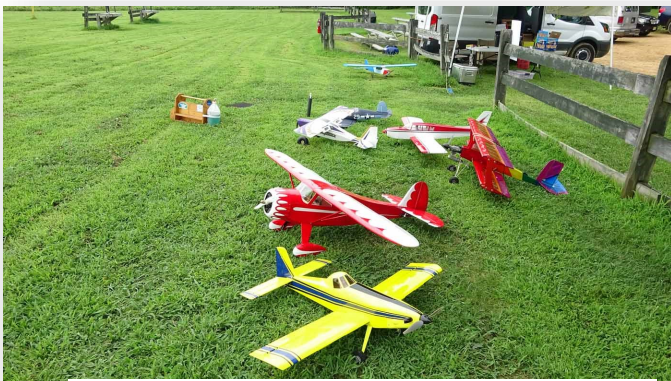
Nice selection of planes in the pits.