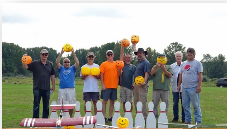
The festive flyers.