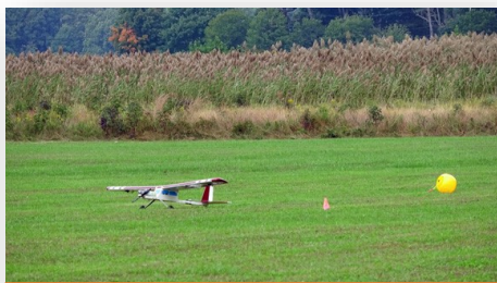
Setting up for the takeoff.