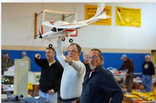
Going three times...