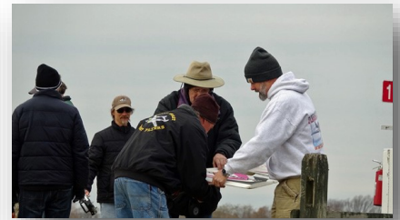
Quick field repair