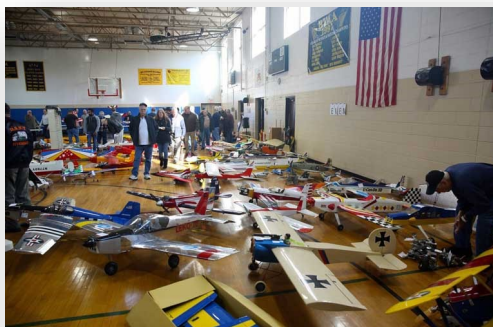
Check out the merch...