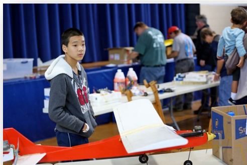
Pondering his purchases