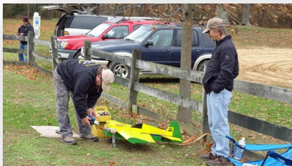
Taking the Deere out...