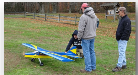
First flight prep