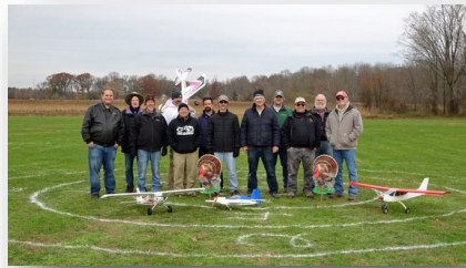
The turkey guys