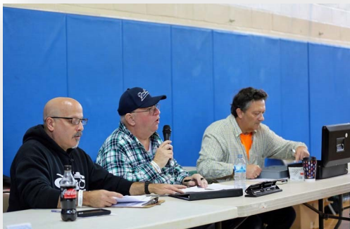
The money men