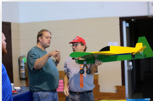
Bob's new contest plane