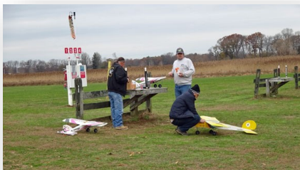
Prepping for a round