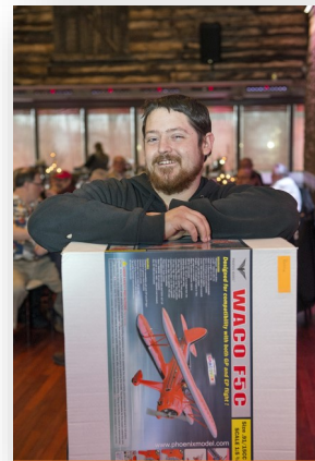
What a smile...