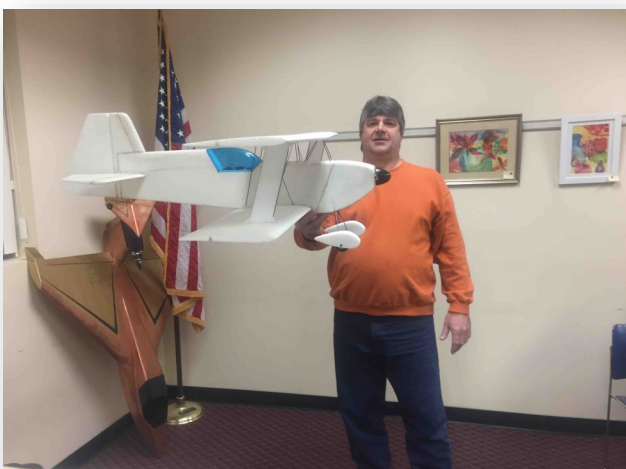
A very cool, retro foam biplane!