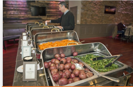
What a spread!