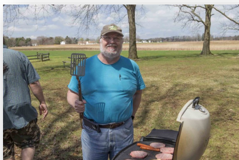
Armed and ready!