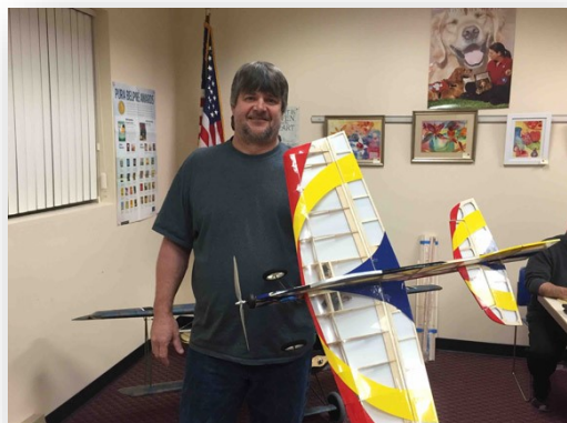
No instructions needed