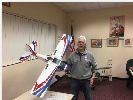
Red, white and blue