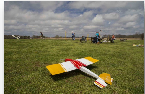
Shot from the pits