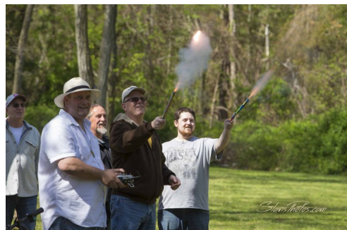
Don’t try this at home