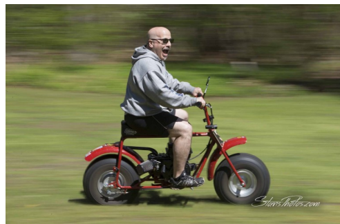
One happy guy!