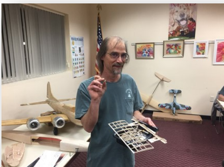
So darn small...