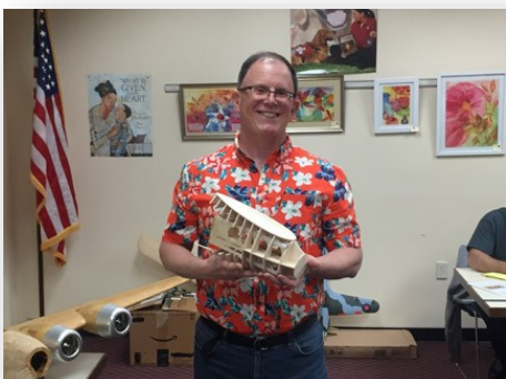
CNC'ed Pancake fuselage