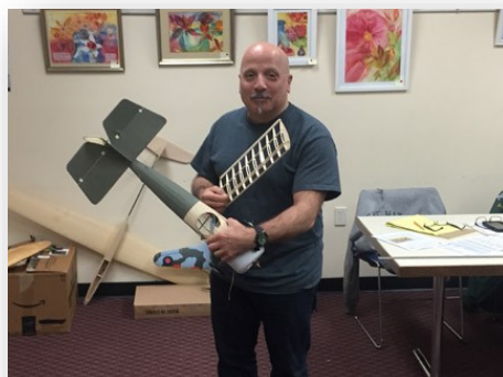
Mike's sweet biplane