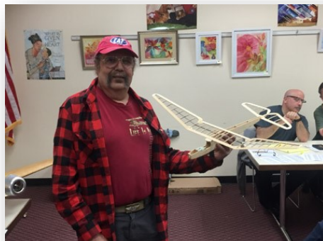
Tony's vintage glider