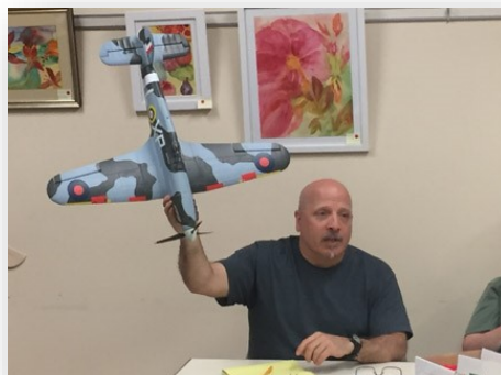
Nice Lancaster escort