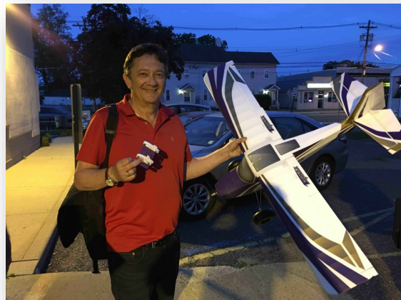
Stu's HK Tundra and spare printed parts.