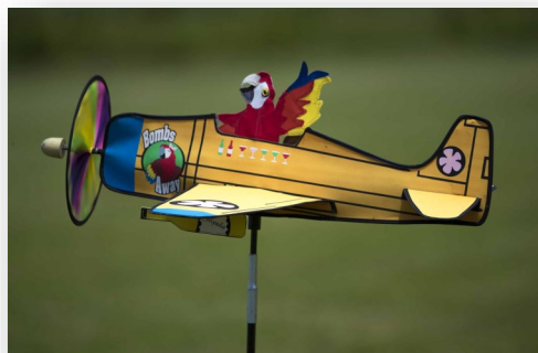
Windsock got quite a workout!