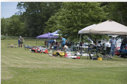
View of the pits