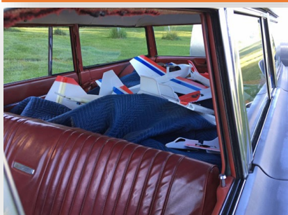
Falcon full of planes!