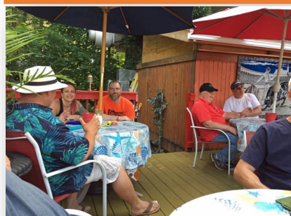
Enjoying a tasty drink