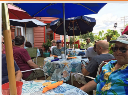
Relaxing at the Cancun