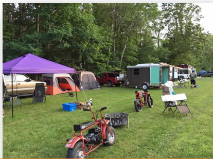
Setting up camp

PS: Special thanks go out to everyone who helped me get my nightflyer out of the tree Saturday night :D