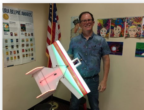
Rob's Bloody Wonder night flyer