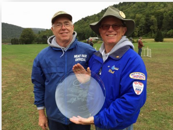
Best Sport Model