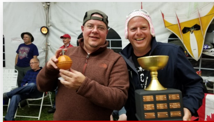
Vapor Games Winners!