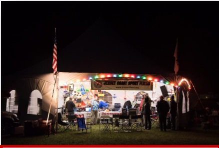
The Big Top