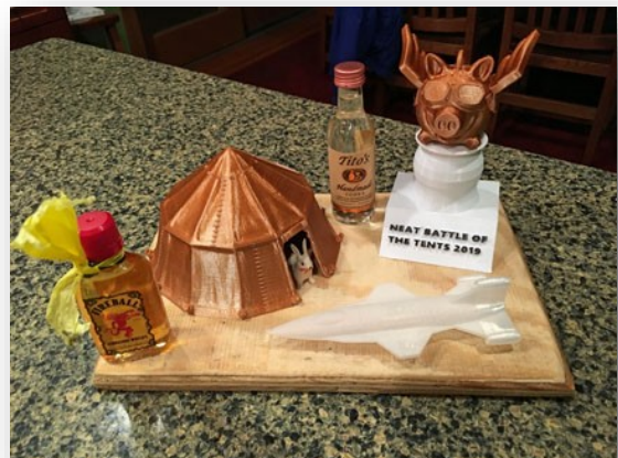
Battle of the Tents Trophy!