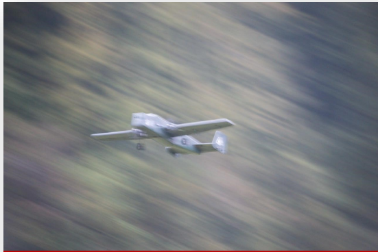
On a bombing run