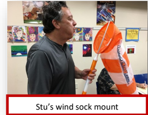
Stu's wind sock mount