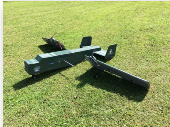
Just add wings