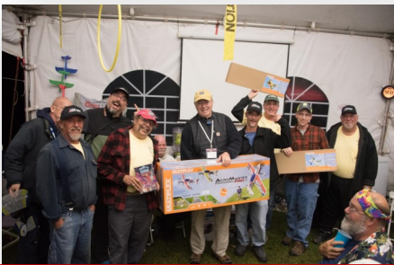
Vapor Games Pilot Prizes