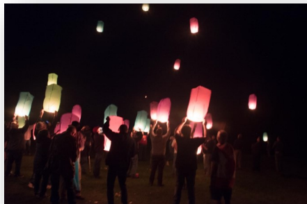
Mass Lantern Launch