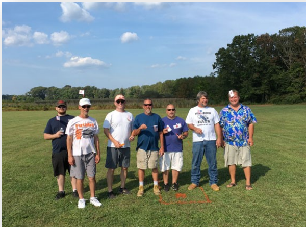
The Admirals and their crews