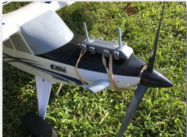
Stu's new bomb drop device in action!