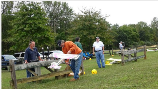
Getting ready for bowling