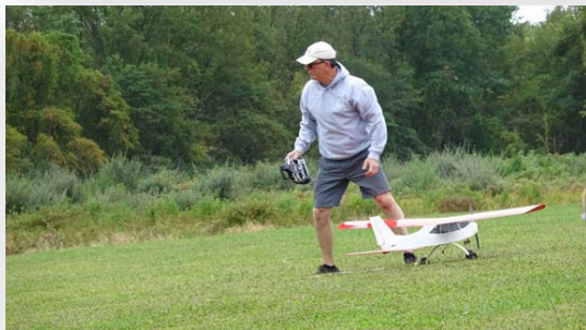
Landed in one piece!