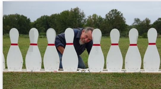
Setting those pins!