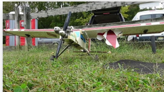
Darn hungry trees!