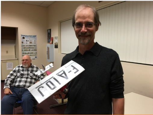
Mike's awesome micro!

Jason's BluFO is naturally built for night-time use. The special feature of this model is the use of an RC Pixel controller, which allows for individually addressed LEDs for great lighting effects. More info can be found at http://particleinnovations.com/ .