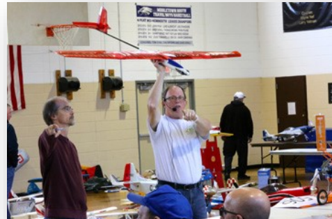
Nice powered glider...