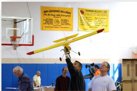
Looks like a contest plane to me.