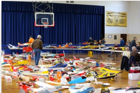
Check out the merch!