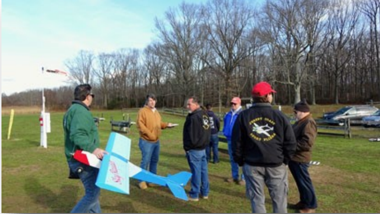
Pilot's Meeting for our annual Brass Monkey on 1/1. The wind was a MAJOR factor that day!