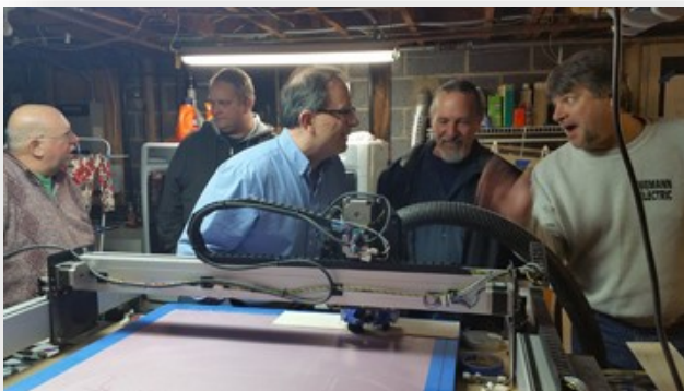
It's not all hard work and focus at our Exec Board meetings. We oftentimes take time out to check what's going on in the host's workshop. Here we're checking out my new CNC router and my first attempts at cutting parts.