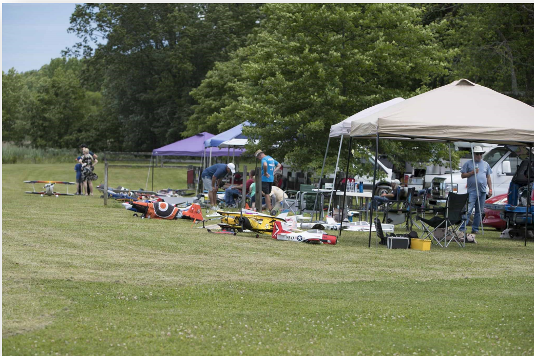
Dreaming of summer flying....