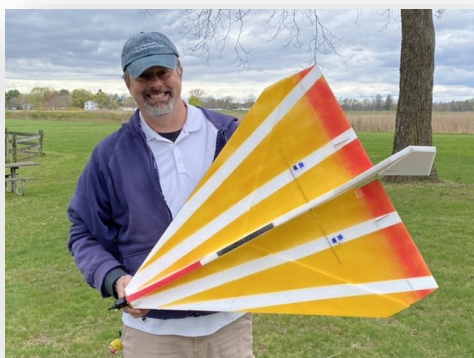
Jason's 3D Delta XL prototype