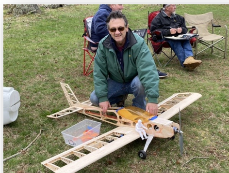
Stu's rebuilt Tiger 60