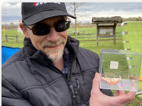
Mike's micro BluFO