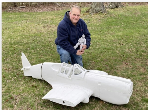
Adam's 1/4 scale P-40