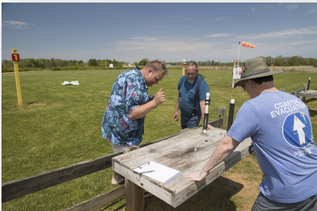
Rolling those dice!