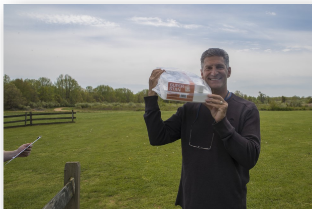
Hey—check that out!