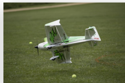
Going for the points