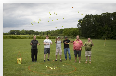
The happy crew!