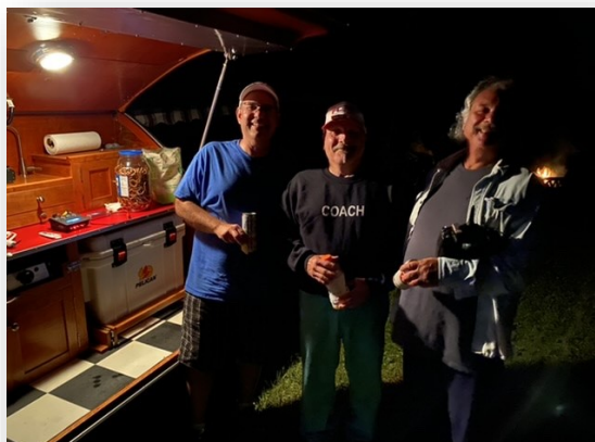
Old friends :)