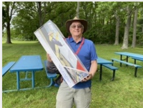
Raffle prize winner!