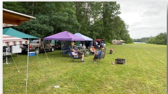
Home sweet home...