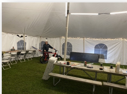
Setting up the new tent