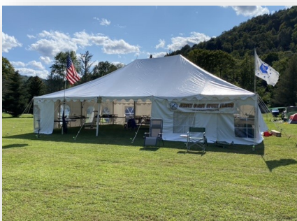
Our new tent!!!