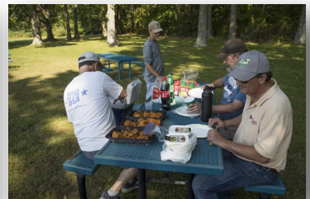
Another delicious lunch