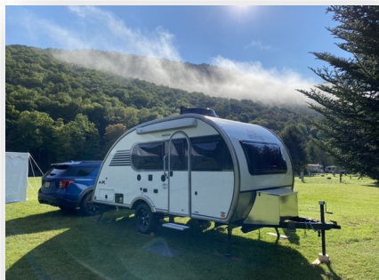
Rob's new digs :)