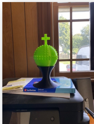
The "holy hand grenade"