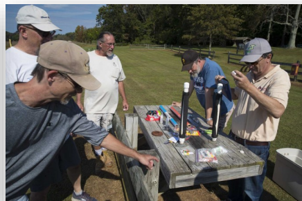
"I'll take that!"