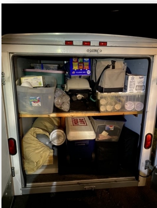
One packed chuck wagon