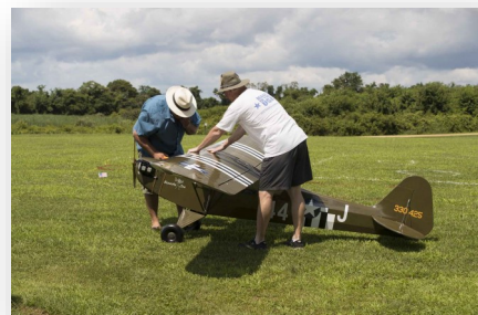
Fine tuning the L-4