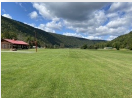
The calm before the storm...