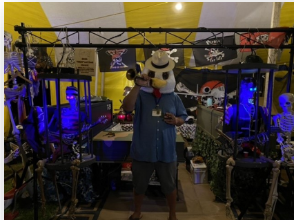
Who is that chicken man???