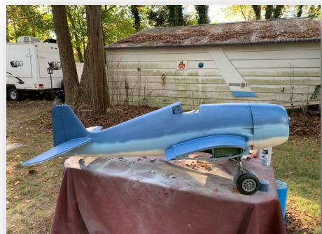
Now the darker blue over it