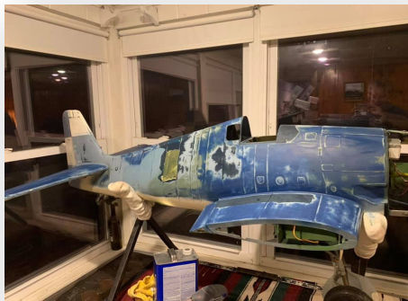
Let the sanding start...