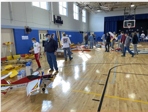
Surveying the merch...