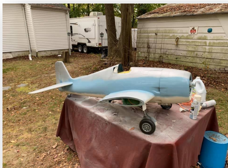
First blue applied