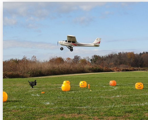
Tom coming in low