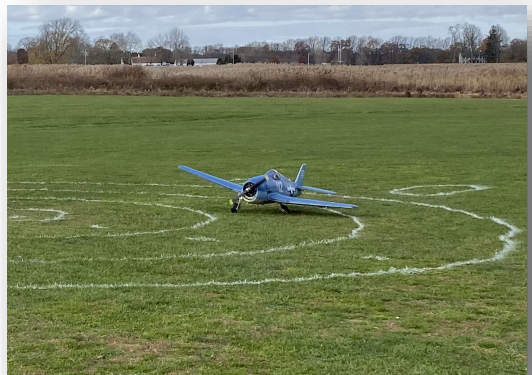
Keeping that wing up!