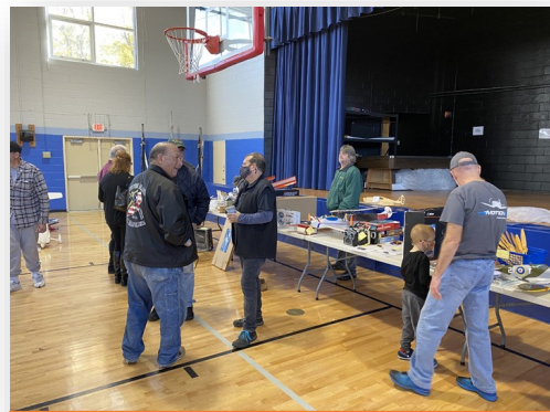
Action at the Fixed Price table