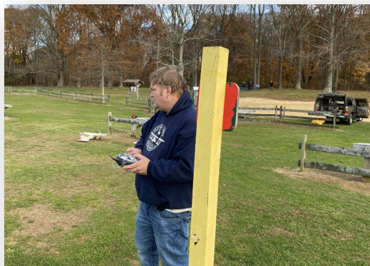
Awfully relaxed for a test flight