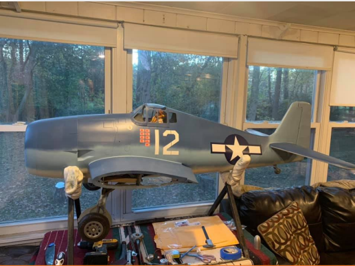
Finished sans weathering...