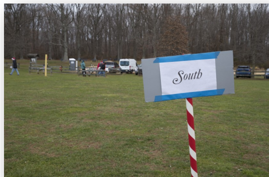
A view from the pole...