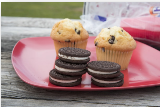
Watch out for the muffins!