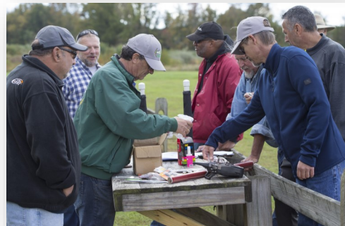
Mmmm... tasty prizes