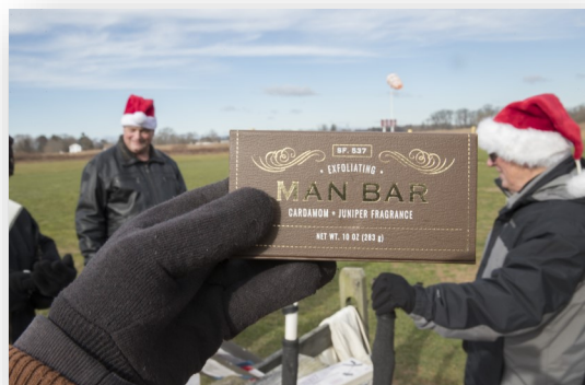
Someone is going to smell good :)

More photos can be found at our website at 2021 Santa's Training Mission ::