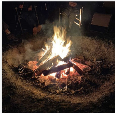
A comfy fire on Friday night.