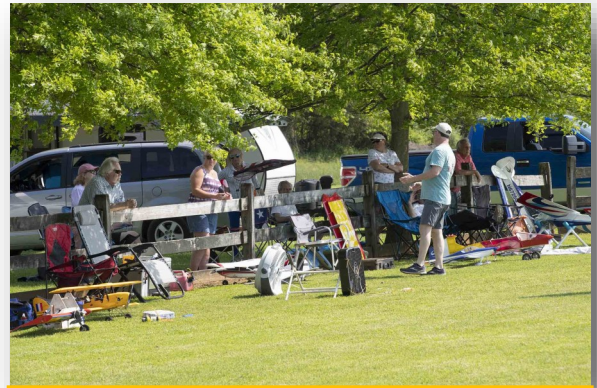
Opening comments for the afternoon