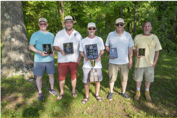
2021 Sport Flier Winners