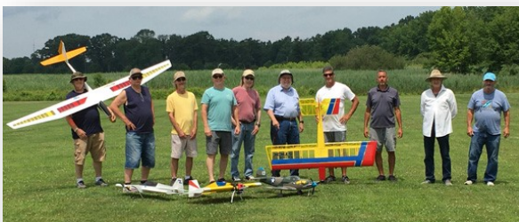
The Open Fly crew

We had a lot of fun at the event, and I managed to get in five solid flights before I had to head off for other commitments. I suggest marking your calendar for our next Club Fly day on October 9th and check out the fun!