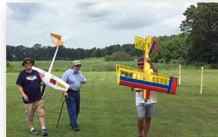
Exit Stage Right..