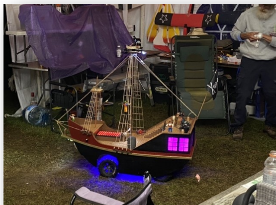
Argh! The Pirate's ship cruises through our tent