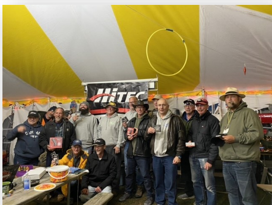
The Vapor Games winners!