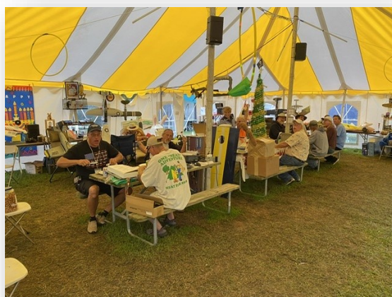
Enjoying a fantastic steak and potato dinner