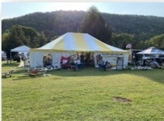
The Killer Rabbits tent