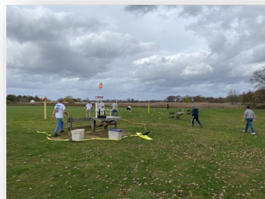
Wind blown score sheets