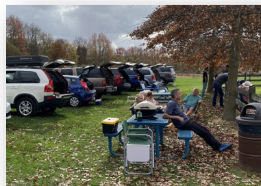
Check out that lineup!