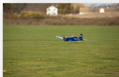
Come and get me...