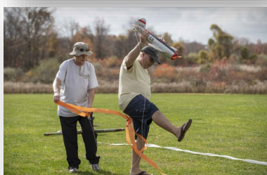
All tangled up...