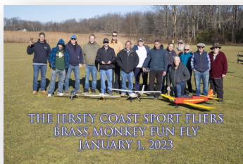
What a great turnout!