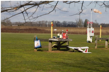
Prepped for deliveries.

A nice part of this event is the grab bag that follows the contest. Everyone who wants to participate brings a small wrapped gift, and the pilots pick based on their finish place. All of the gifts were very cool, and a lot of laughs were heard. Afterwards a number of us stayed behind to get in some additional flights as this would likely be it for the year, then grabbed some lunch at MJs down the street. Once again I believe everyone had a fantastic time and I look forward to CD'ing this event again this year!