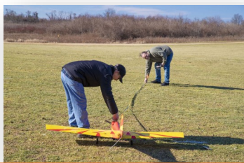
Spot landing measurement.