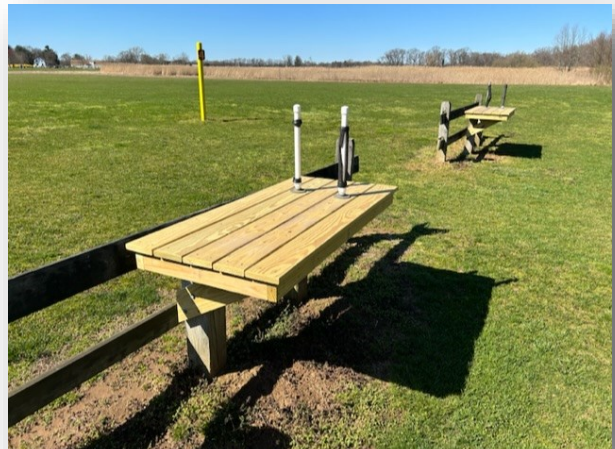
The newly rebuilt prep tables that the Park did for us. These have become very popular with our pilots.