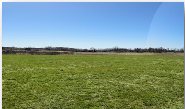
A panoramic view of our flying field with the brush cut by the Park staff.