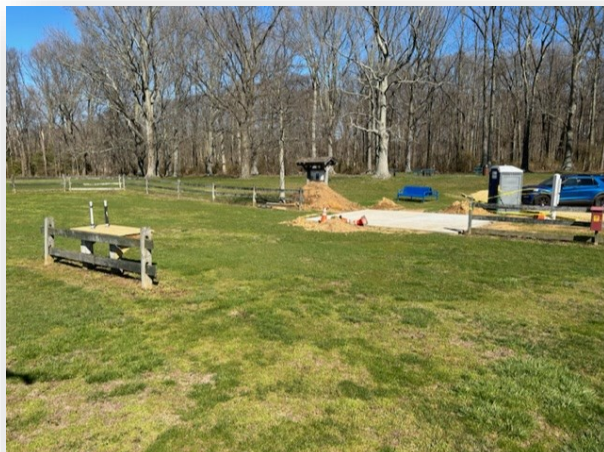
Another view of the upgraded pit area.