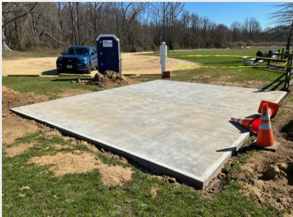
Another view of the new gazebo pad. It sits to the right of the existing center entrance to the pits.

I recently took a trip to the field before our first contest to check things out myself, and I was very happy to see that not only was the concrete pad already poured for the new gazebo, but the Park had clear cut the brush and weeds that surround our field and also rebuilt our prep stations in the pits. When I checked with Dave about this, he indicated that the Park folks insisted on rebuilding the flight station tables (which we/the club was planning to do ourselves this year). When you look at the field now it seems like our flying space has increased dramatically due to the clear cutting of the brush, and the new tables give the pits a clean look. When you include the soon-to-be installed gazebo and its own special features it's going to make for a very exciting year at Dorbrook as we celebrate our 50th anniversary!!!