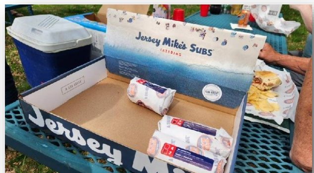
We had a bunch of hungry guys!!!