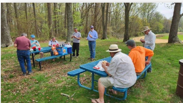
A satisfying lunch after the contest