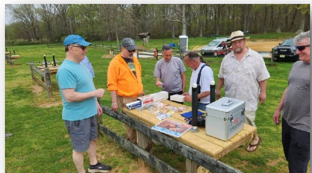
Tallying results and picking prizes