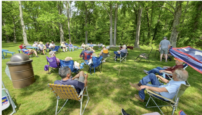
A gathering of friends for a fantastic event!

All in all it was a really nice, relaxing and fun day. Maybe I can talk a few more of you fine folks to join us next year..(hint, hint, nudge)