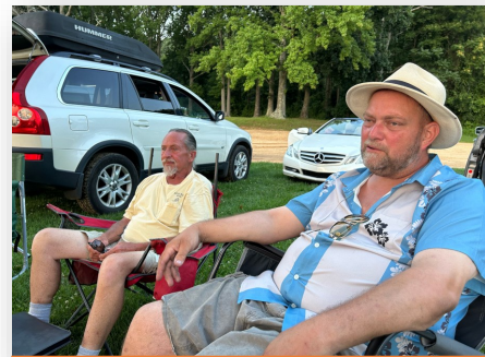
Prepping for the meeting