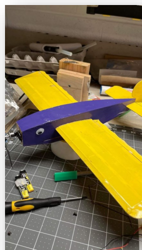
Jason's Park Scale Models Mini Stick build