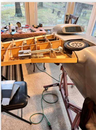
Adam's 1/3 scale P-51 build

Since it's building season I thought I'd share some ongoing project work that members are doing. If you're up to something—share! Send your project photos to rob.kallok@comcast.net and I'll include them in an upcoming issue!