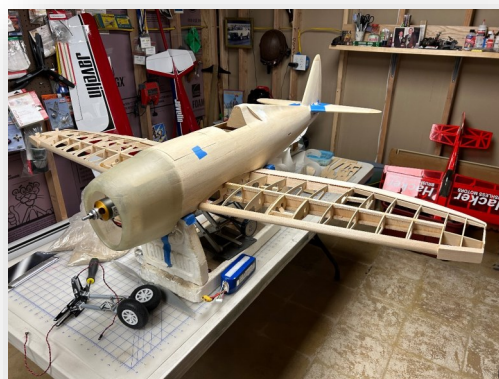
Rob's 60-sized Top Flite P-47 build