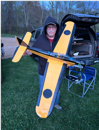
Joe's Midwest Zero