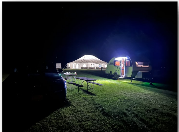
Friday night 9/6—the quiet before the storm...