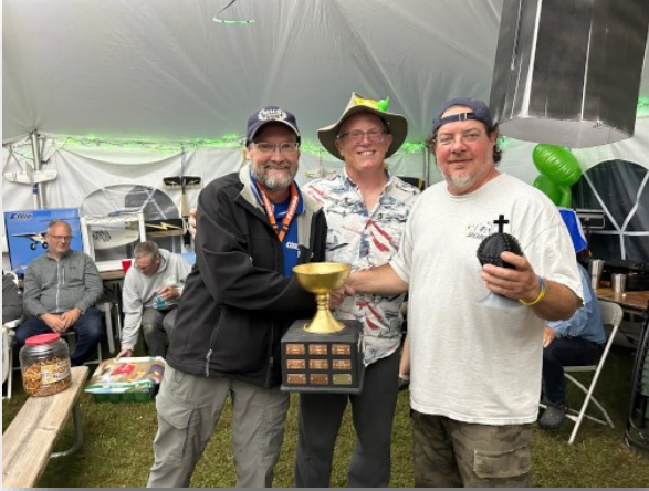
2024 Vapor Games winners!!!