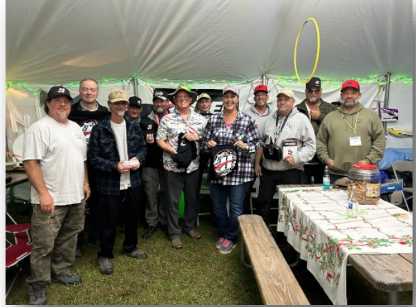
Vapor Games Pilot Prizes by Hitec