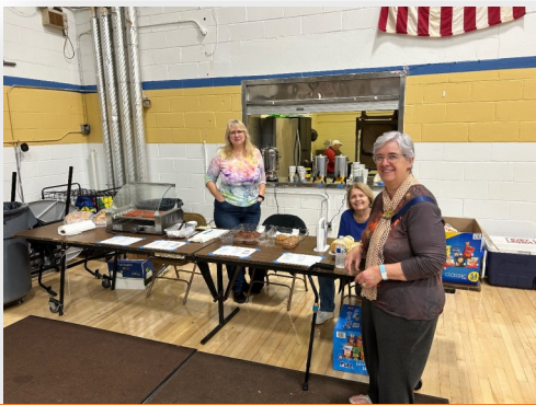
The ladies staffing the concession stand.