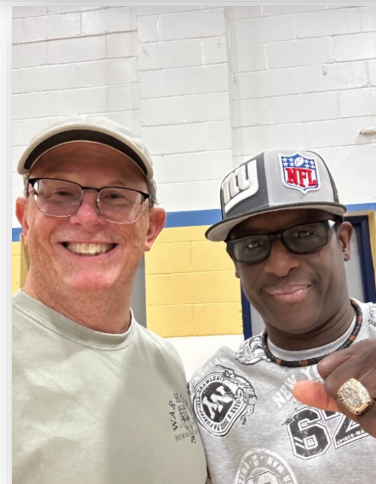
Our 50/50 winner—Stephen Baker from the 1990 Giants Super Bowl team!!!