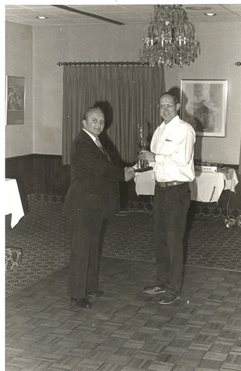
6TH PLACE SPORT FLYER 82

This month's club meeting is on Tuesday June 24th starting at 7pm at Dorbrook. We'll be cooking hot dogs and talking about airplanes, then flying them afterwards. Please be sure to bring a MOTM entry to show off!!!