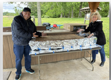
Keeping the food warm